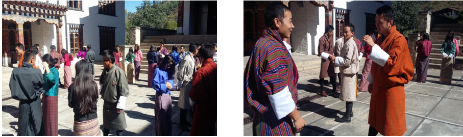
FIGURE 2. Creating more opportunities to interact through circle chat activity.