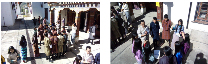
FIGURE 1. Jig-saw strategy as a means to create opportunities to maximise interaction.

Using student-centred approaches can help create opportunities to interact in the class (Rai, 2002; Rinchen, 2006; Robertson, n.d.; Sherab, 2013a). Robertson (n.d.) states that think-pair-shares and circle chats are very simple and effective strategies to make students participate in the class. To create more opportunities in the class, I lectured less in the class, exercised more activity-based lessons, and always prepared the lesson well.