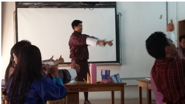
FIGURE 4. Giving thumbs up cheers to one of the participants for his opinions to encourage more interaction.

Cheers such as “Thumbs up”, “Wow cheers”, “applauses” were given to the participants. Moreover, whether participants gave correct or incorrect answer, I always acknowledged their responses and accepted their answer. Thus, participants interact more, even if they are not sure with their responses.