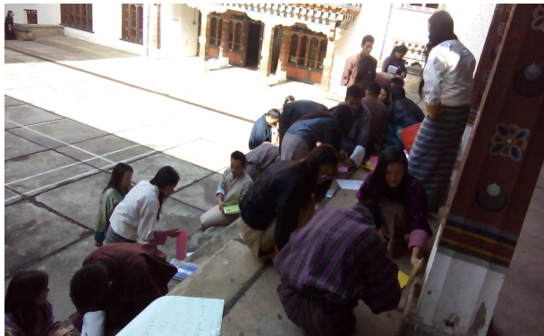
FIGURE 3. Incorporating collaborative play as a means to maximise interaction.

It has been found that a teacher's personality and students' hesitation to speak in the class are closely related. Ferlazzo (2013) states that teacher should make students realize that they are cared for and should be approachable at all times. If teachers maintain a healthy relation with students and incorporate humour in the class, students interact and learn more (McNeely, 2011; Weimer, 2013). In the baseline data, it has been identified that I usually had serious looks and that I needed to use humour (Sherab, 2013a) in the class. McNeely (2011) states that when teachers share a laugh or a smile with the students, they help students feel more comfortable and open to learning. Using humour brings enthusiasm, positive feelings, and optimism to the classroom. Besides this, Eagen (2011) also states that humour encourages an atmosphere of openness, develop students' divergent thinking, improve their retention of the presented materials, and above all it is a valuable teaching tool.