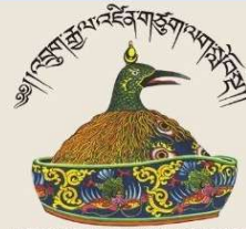
Royal University of Bhutan